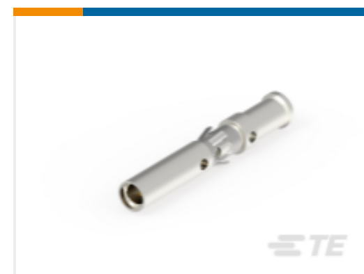
TE Part # 193846-1 SKT ASSY.