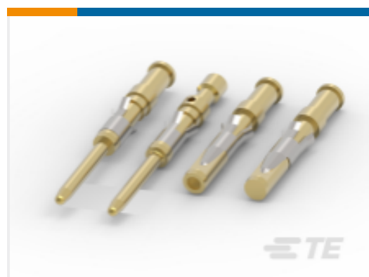
TE Part # CAT-AM71-T98 Pin and Socket Contacts, Type II