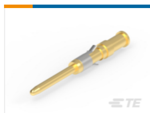
TE Part # 207893-1 CONTACT PIN ASSY.