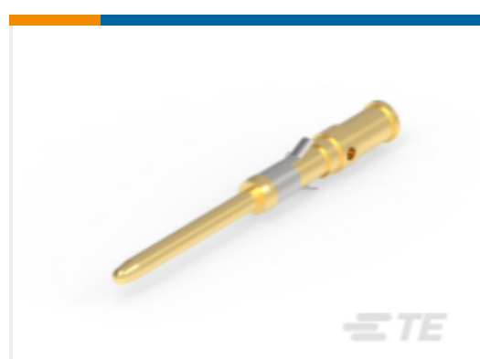
TE Part # 204219-1 PIN CONTACT ASSY.