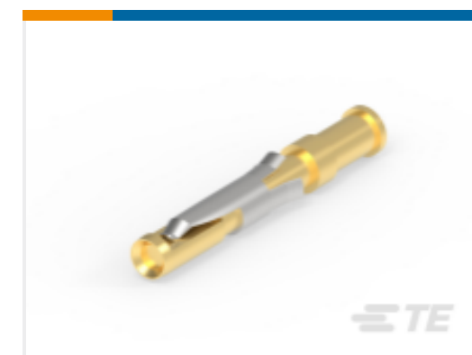
TE Part # 207896-1 CONTACT SOC. ASSY.