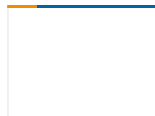
TE Part # 130743-1 CONTACT ASSY, SOCKET, SZ 16, LONG