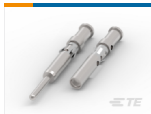
TE Part # CAT-AM71-T98A Strip Pin and Socket Contacts, Type III, LP