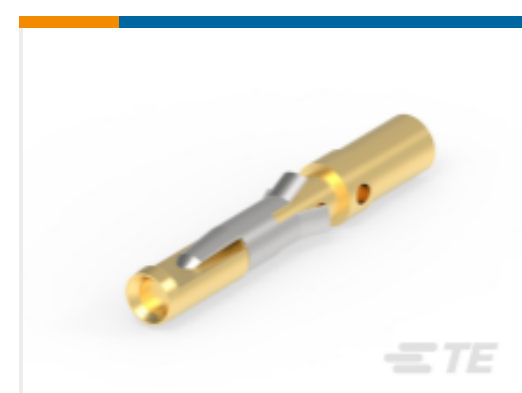
TE Part # 202726-1 CONTACT SOCKET ASSY.